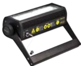
2. Obelux CR9 Forensic Light