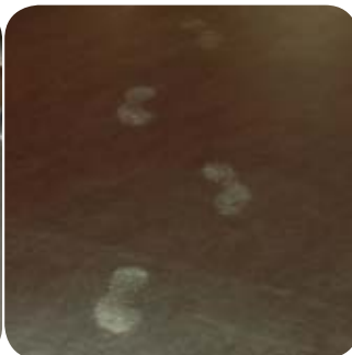
CR9-W-B1 : Footprint