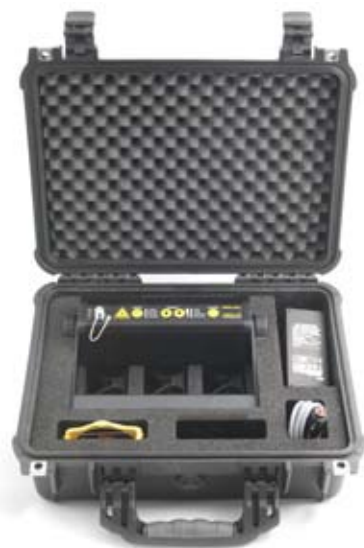
1. Carrying case