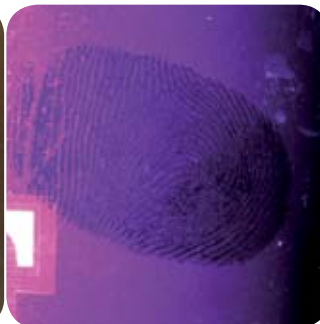
CR9-B-A2 : Fingerprint