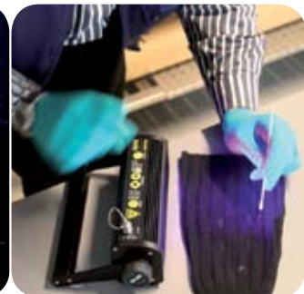
CR9-BCG-A2: Laboratory investigation