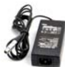
3. AC Adapter